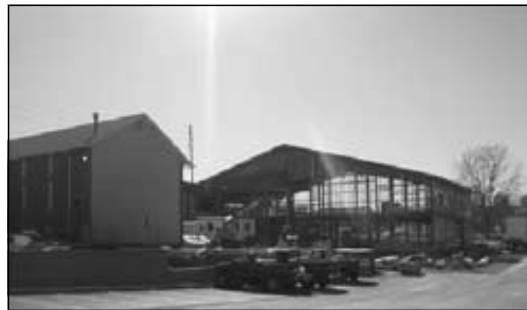
(L) Willott Road Community Church is the first BGW project in the St. Louis area.

recommended Building God's Way and the congregation voted affirming their decision. A design charette will be scheduled in the near future to begin the process of turning another vision into a reality.