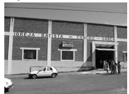
The host church in Garca, Brazil.