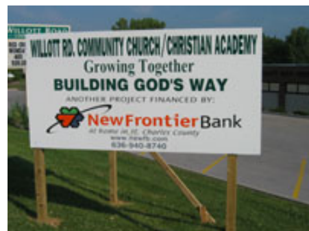
Sign displayed at Willott Community Church.

Demien Construction is pleased to be partnering with Building God's Way to complete this 21,000 square foot addition that will hold a multi-purpose room and classrooms. This is the first Building God's Way project to break ground in the St. Charles, MO area.