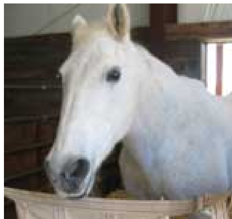
Trained to be a dressage show horse, Gracie was donated to TH in 1998.

After many years of operating in rented space, Therapeutic Horsemanship opened its new facility in May 2003 located on 100 acres near the intersection of Highways N and Z, in Wentzville, MO. TH could not exist without the support of approximately 250 volunteers and donations from numerous sources. For more information contact the TH office at 636-441-9944.