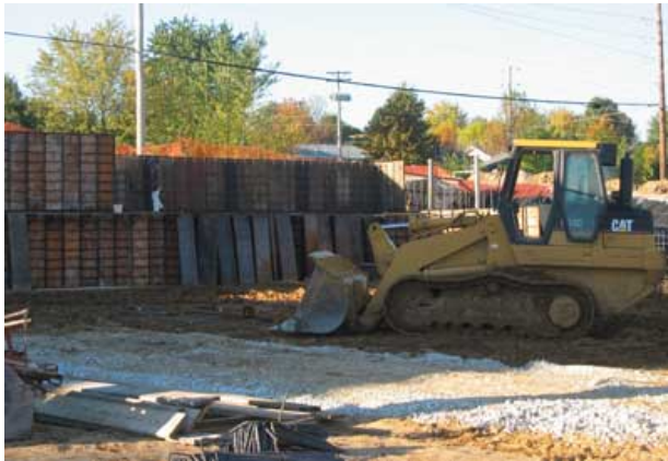
Willott Church begins their BGW project with land excavation. Demien Construction begins pouring footings which is the foundation of the new project.