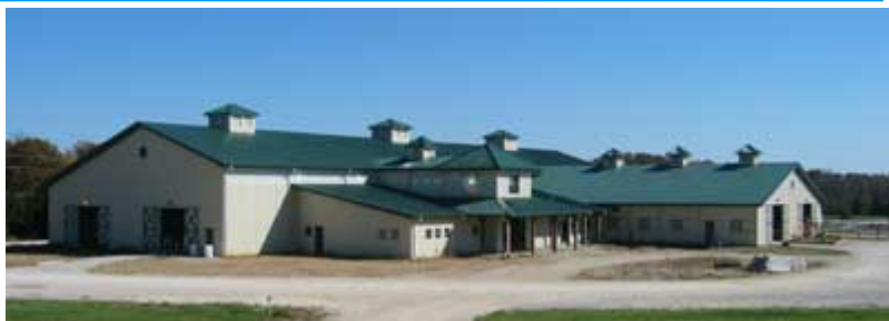
Therapeutic Horsemanship opened their building in May 2003.